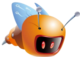
Figure 3. İTÜRO bee logo